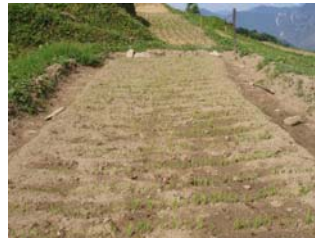
Raising seedlings in nursery