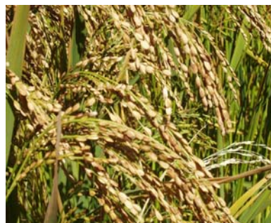
Control plot almost ripe for harvest