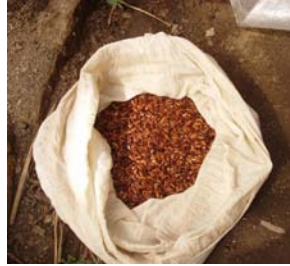
Seeds after soaking in water