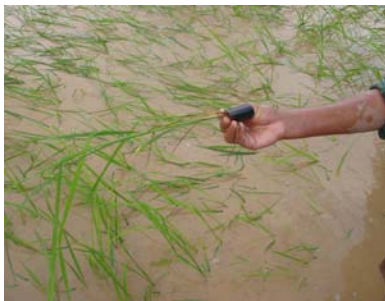
Transplanted seedlings at random in control plot