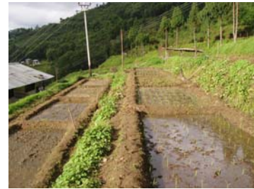
Transplanted seedlings in square pattern