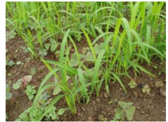
3-leaf stage seedling age