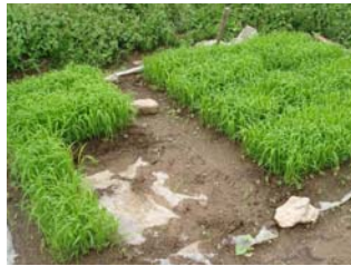
3-leaf stage seedling age