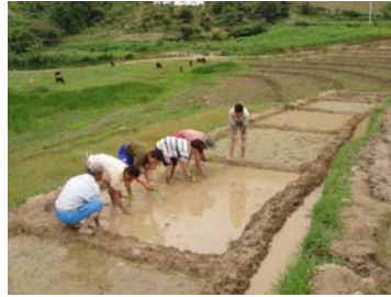
Transplanting at 3-leaf stage