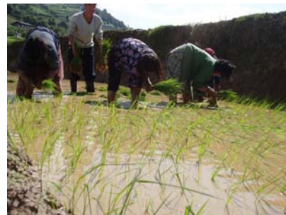
Transplanted seedlings at random in farmer's field