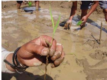
Transplanting at 3-leaf stage