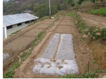
Nursery bed treatment (solarization technique)