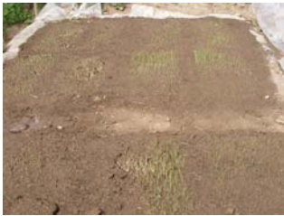
Raising seedlings in nursery