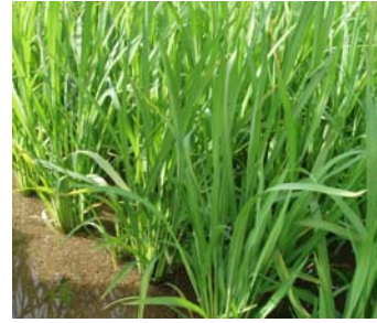
Few weeks after transplanting (with intermittent irrigation on SRI plots)