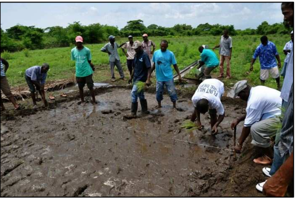
Second half of the field was transplanted with the aid of a planting string, which seemed easier for the farmers.