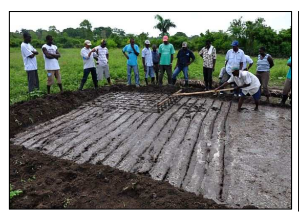
In the first half of the plot, we practiced the transplanting after using the marker to create the gridlines