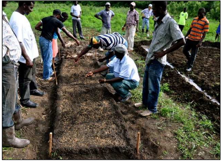
Establishment of the SRI nursery bed and application of manure to the soil surface

Seeding of pre-germinated seeds: We tested three different seed preparation treatments: i) seed soaking for 24 hours, ii) seed soaking and pre-germination under heated conditions, iii) seed soaking and pre-germination under non-heated conditions. It seemed that there was not a remarkable difference between the treatments. Farmers can thus adopt the simplest technique of seed soaking only.