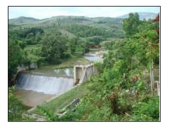
Circled in red in center, the location where the SRI demonstration plot will be installed

The first SRI plot with seedlings produced during the SRI training will be transplanted on land of the training center on a 250m<sup>2</sup> plot.