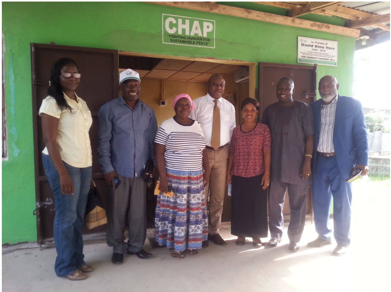
CARI, Africa Rice, IFAD and CHAP meeting, Jan. 11, 2017

"Improving the livelihood of urban and rural farmers"